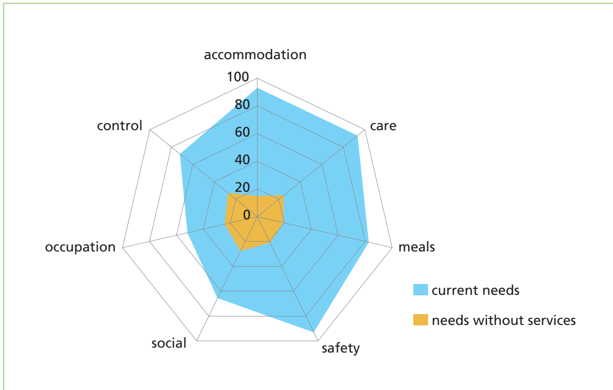
Figure 2: Older adults’ outcomes: current and expected SCRQOL

Note: SCRQOL shown as percentage of total possible score for each domain